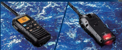
Float'n Flash function (front/back)

The radio floats with a flashing LED light to help you retrieve it from the water.