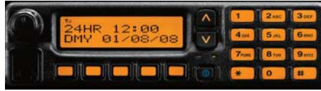
Internal clock setting example

With a high contrast dot matrix display, upper and lower case characters can be easily distinguished. The display shows 12 characters by 2 lines. LCD backlight is standard.