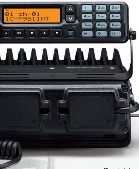
Photo includes optional RMK-4, OPC-607, SP-22, SP-30 and HM-148G.

The IC-F9511HT's RF (main) unit dimensions are only 175 (W) × 60 (H) × 279 (D) mm (6 \frac{7}{8} × 2 \frac{3}{8} × 10 \frac{31}{32} in), so the RF unit can be fit into a "letter size" console box.