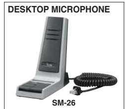
SM-26 : Convenient for dispatching, equipped with monitor switch. SM-25 is also available.