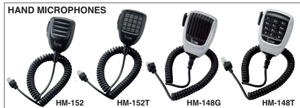
HM-152 : Regular hand microphone. HM-152T : DTMF microphone. HM-148G : Heavy duty microphone. Self-grounding type. Same as supplied. HM-148T : Heavy duty microphone with DTMF keypad. Self-grounding type.

Some options may not be available in some countries. Please ask your dealer for details.