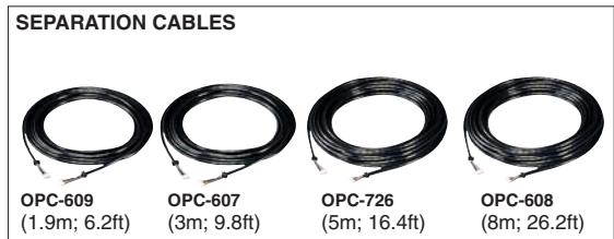
OPC-609 : 1.9m; 6.2ft separation cable. OPC-607 : 3.0m; 9.8ft separation cable. OPC-726 : 5.0m; 16.4ft separation cable. OPC-608 : 8.0m; 26.2ft separation cable.