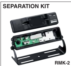
RMK-2 : For front panel detachment installation. Use with one of the following separation cables.