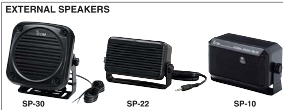
SP-30 : 20W rated input power (30W max. input). SP-22 : Compact and easy-to-install. Same as supplied with IC-F9511T/F9521T. SP-10 : Compact mobile speaker. SP-5 : Large speaker for good audio quality.