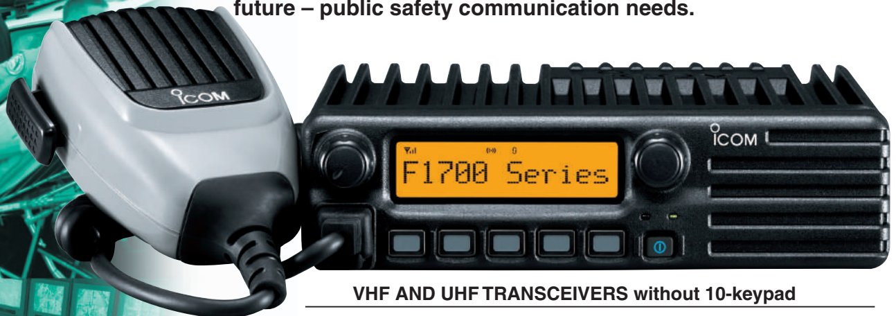
VHF AND UHF TRANSCEIVERS without 10-keypad

For organizations who run an analog radio system and must migrate to a conventional P25 digital system, Icom provides one of the best solutions. The new F1721D series mobile allows you to program P25 digital and/or FM analog mode per channel. Flash ROM capability means future upgrades and flexible customization, tailored for your system. Moreover, built-in multiple tone signaling capability and an optional voice scrambler satisfy existing analog FM system requirements. This new Icom's frequency coverage and rugged construction ensures a flexible, long life radio for you. Icom is the smart choice for current – and future – public safety communication needs.