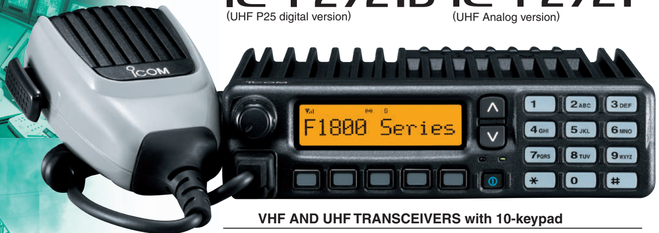
VHF AND UHF TRANSCEIVERS with 10-keypad