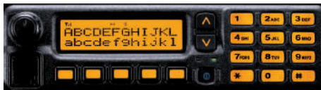
Two line setting display example

Using a high contrast LCD, the IC-F1721/F1821 series shows operating channels, tone and other settings clearly under nearly any lighting conditions. With a dot matrix display, upper and lower case characters can be easily distinguished. In addition, you can change the display setting to show one line and 12 characters, or two lines and 24 characters via programming.