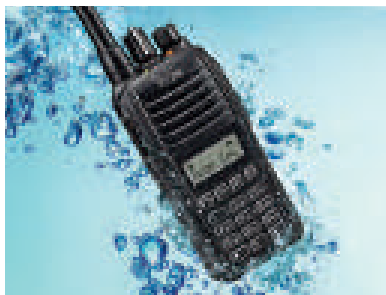
Waterproof for 30 minutes in one meter depth of water