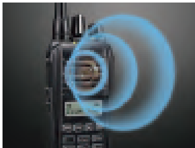
1500 mW powerful audio