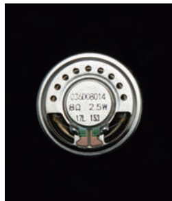
Icom custom high power handling capacity speaker